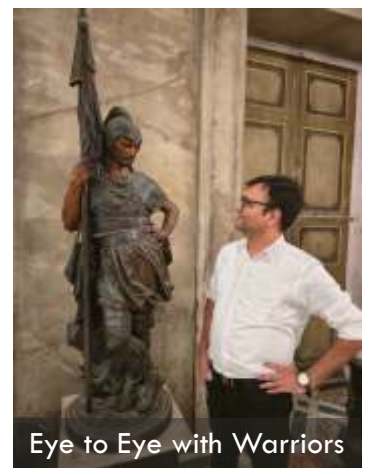
Eye to Eye with Warriors