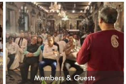
Members & Guests