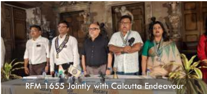
RFM 1655 Jointly with Calcutta Endeavour